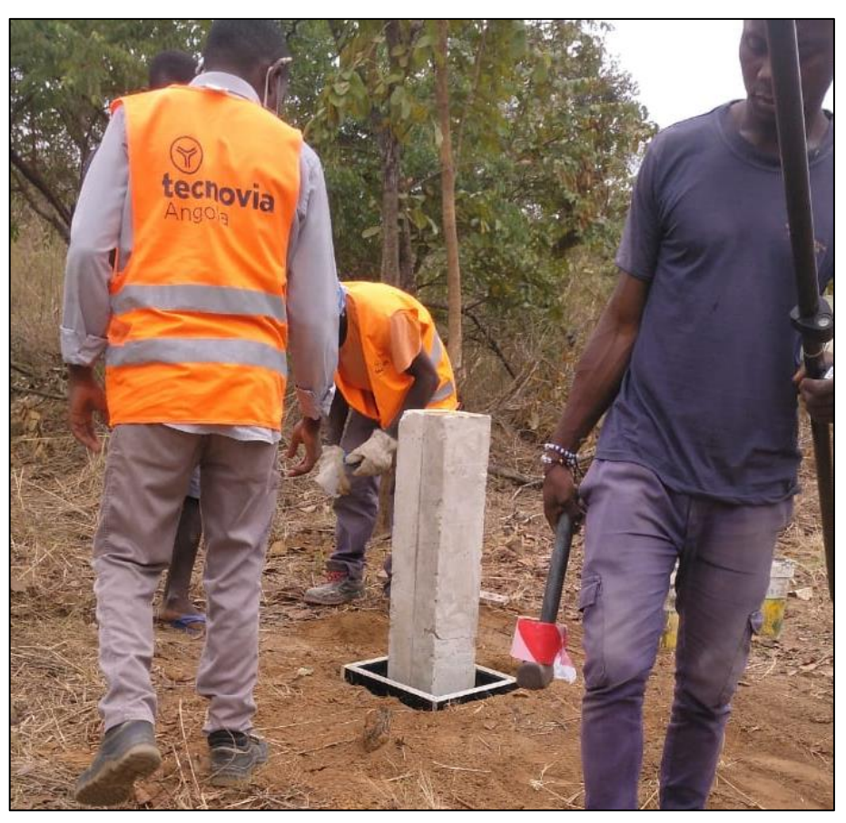
Figure \ 1-Cabinda \ Phosphate \ Project, \ licence \ marker \ installation.